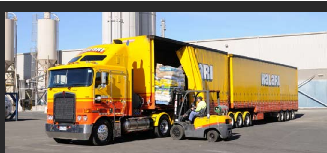
Kalari's LNG-fuelled K108 is now hauling a 68 tonne GCM B-Double tautliner.